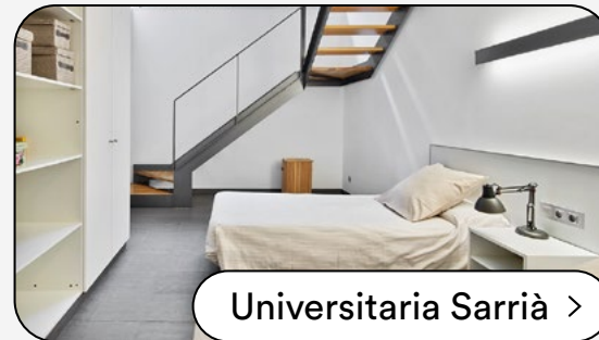
Universitaria Sarrià >

C/ Esports, 1-7 Tel.: +34 93 206 55 40 e-mail: campus@residenciasarria.com