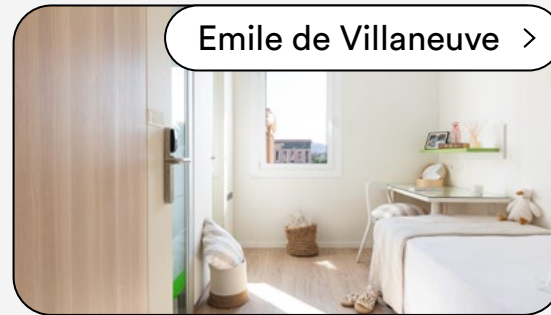
Emile de Villaneuve >

We have signed agreements in place with the following residence halls closest to IQS that offer student accommodation.