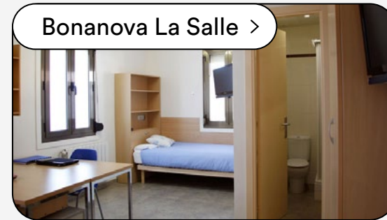
Bonanova La Salle >

C/ Passeig de la Bonanova, 8 Tel.: +34 93 254 09 65 / 607 085 459 e-mail: info@residencialasalle.com